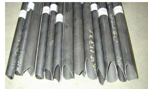
Profiled chassis tubes.

Marl Technologies has been designing and manufacturing custom mobile geotechnical drill rigs since 1977. Marl Technologies has also supported Formula SAE since 2006. Thanks for the continued support!