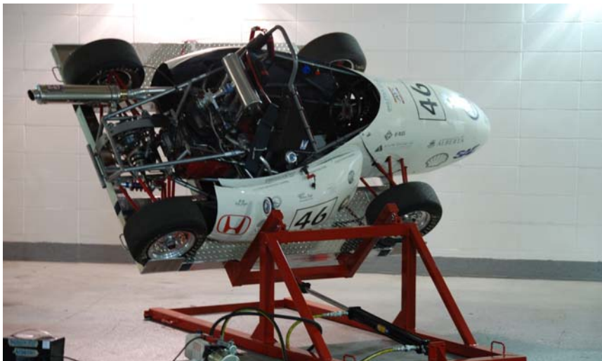
ABR '08 at a 45° tilt.

The tilt table has the capability to tilt the car in both lateral and longitudinal directions and can tilt the car over 65° degrees in each direction. Tilting to this degree simulates a turn of approximately 1.5 lateral G's.